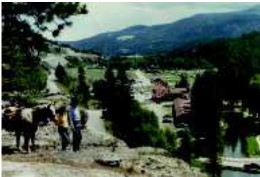
Fun Valley, South Fork, CO